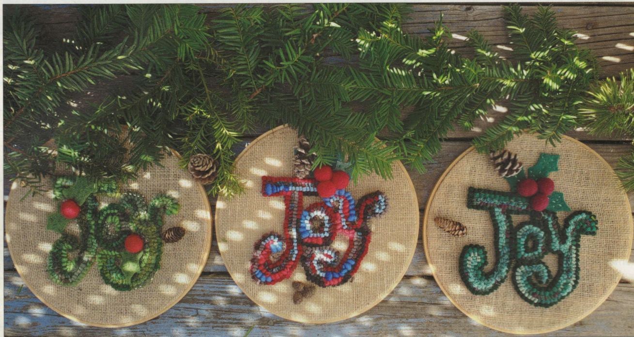
Brighten up your holidays with hoop art!

W hen do the holidays begin for you? What brings on that first feeling of Christmas joy? For me, it starts the first time I hear a certain Christmas song. From then on, I am in the holiday spirit.